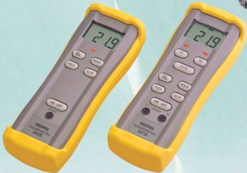
Single Input DTM 305B